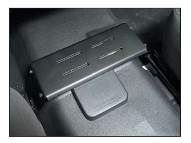
Loosely pre assemble front hump bracket with 1/4" x 3/4" bolts and flat washers, then position it under the OEM front seat brackets.